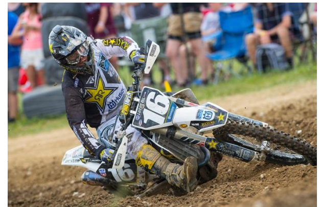
After posting the fastest 250 qualifying time and finishing second overall he is currently fifth in 250 rider point standings